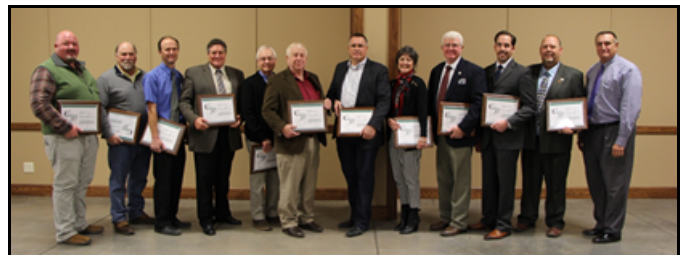
Western Planner awards presented in 2017