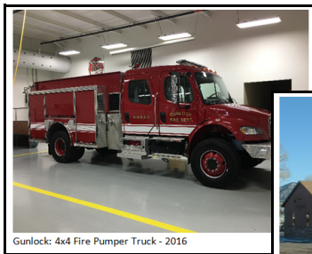
Gunlock: 4x4 Fire Pumper Truck - 2016