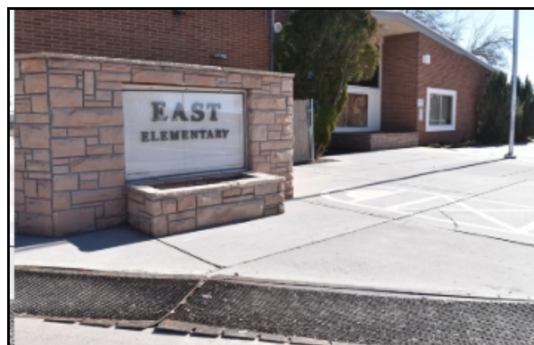
Former East Elementary School building will be transformed by Dixie State University into Innovation Plaza.

Dixie State University is a strong economic partner in the southwest region, and has a strong partnership with the Five County Association of Governments. Many local, state, and federal contributors have made this investment grant application and award successful, and we are happy to see their hard work accomplished with this competitive federal investment from EDA. The Innovation Plaza will be another positive step, and powerful addition to diversifying jobs in the local Utah economy. This grant will enable entrepreneurship, innovation, and bio-technologies to continue to expand in the region and be a benefit to future job growth.