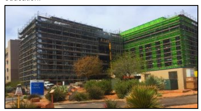
Expansion underway at Dixie Regional Medical Center (current photo)

research project that would provide essential information to all five counties which would assist them in their economic development activities, specifically in determining which industries and companies best fit and enhance our southern utah communities' economies. He has studied and written extensively on the issues confronting rural communities in America. These areas include natural resource concerns, economic restructuring, demographic trends, poverty, inequality, and education.