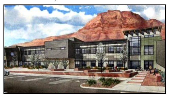
Rocky Vista University College of Osteopathic Medicine (rendering)

of Rocky Vista University College of Osteopathic Medicine, currently under construction in Ivins, Utah.