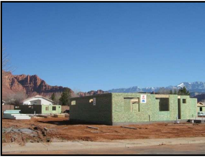
Two housing units with SIPs in place

In addition to the above mentioned education goal, CCCHI endeavored to have the walls raised on 2 homes by the end of 1 day. Amazingly, with the help of the dedicated