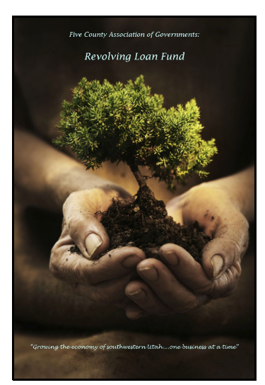
"Growing the economy of southwestern Utah....one business at a time"

Five County Association Governments is of proud to announce that 100 business loans have been provided through its Revolving Loan Fund (RLF). Since its creation in 1987, the RLF has provided nearly $6.52 million in funds to area businesses and created/retained approximately 740 jobs.