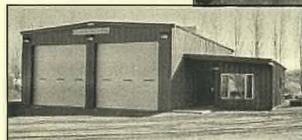
Big Water Fire Station