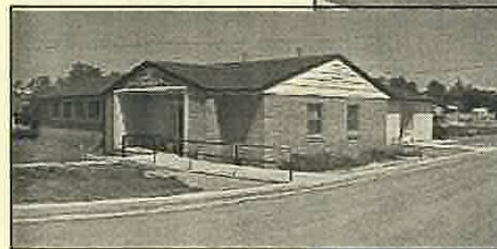
Enterprise Senior Citizen Center