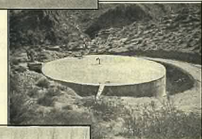
Hurricane Water Tank