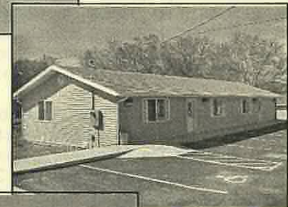
Minersville Senior Citizen Center