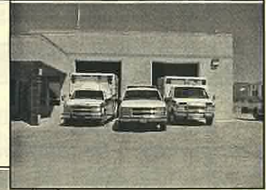
Iron County Ambulance Garage - Cedar City