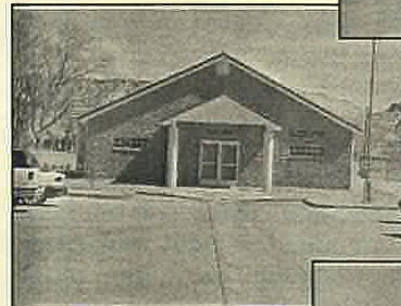
Cannonville Medical Clinic/Town Hall