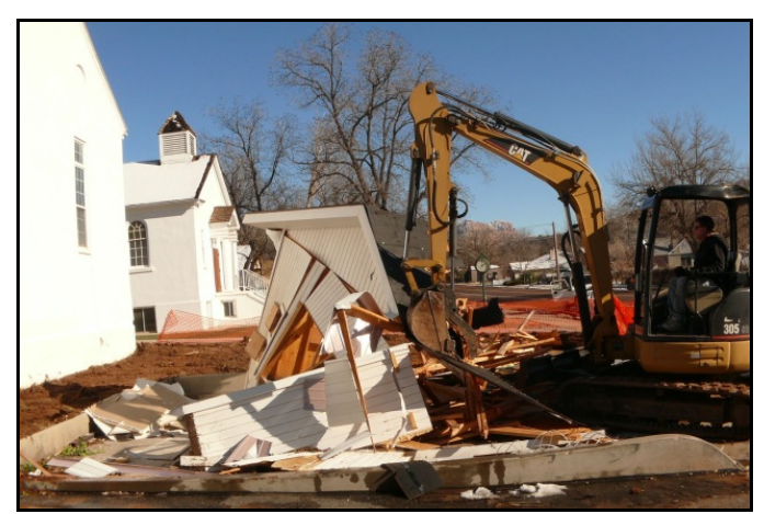
Site demolition began on January 3, 2011 to make way for new Rockville town office addition

Work began on January 3, 2011 to make room for a new town office addition in front of the Rockville Town Community Center recreation hall structure. As of January 17th framing of the facility was underway.