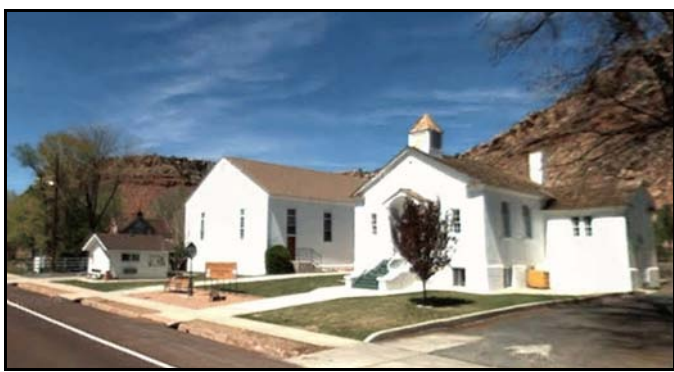
Rockville Community Center

Town leaders have continuously budgeted for repairs and upgrades to the facilities. They have replaced both roofs, added central heating and cooling to the main hall and have repaired the stucco exteriors and painted both buildings.