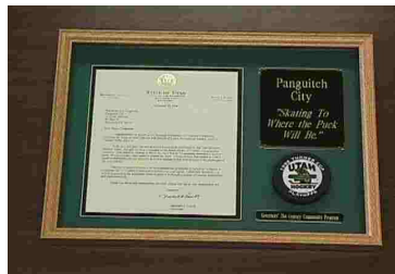
Plaque recognizing application to the 21 st Century Communities Program